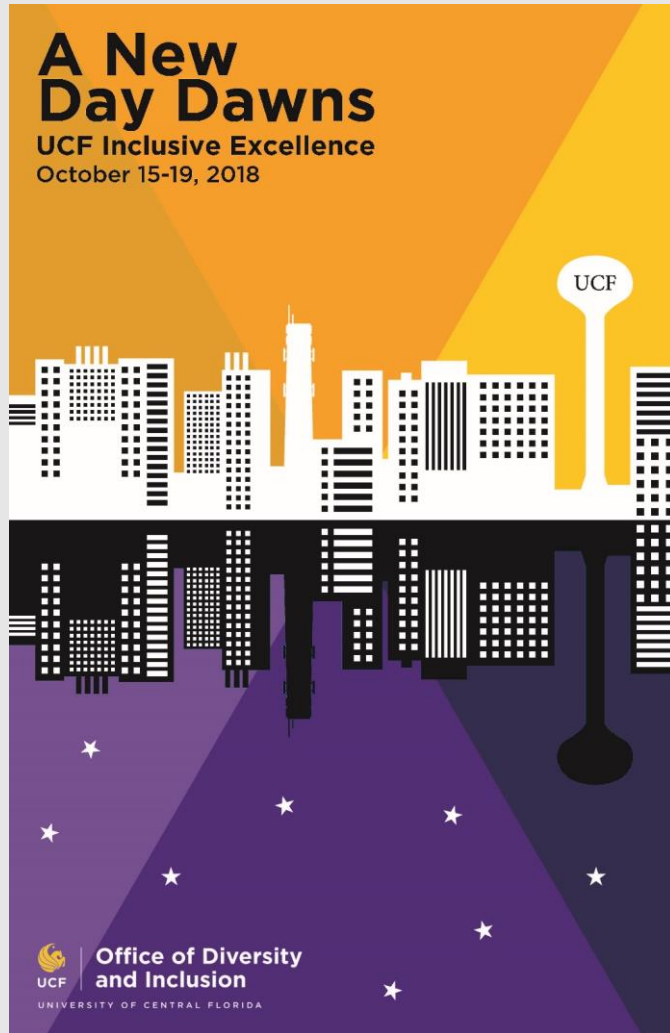
2 nd Place Hunter Pylant UCF Student